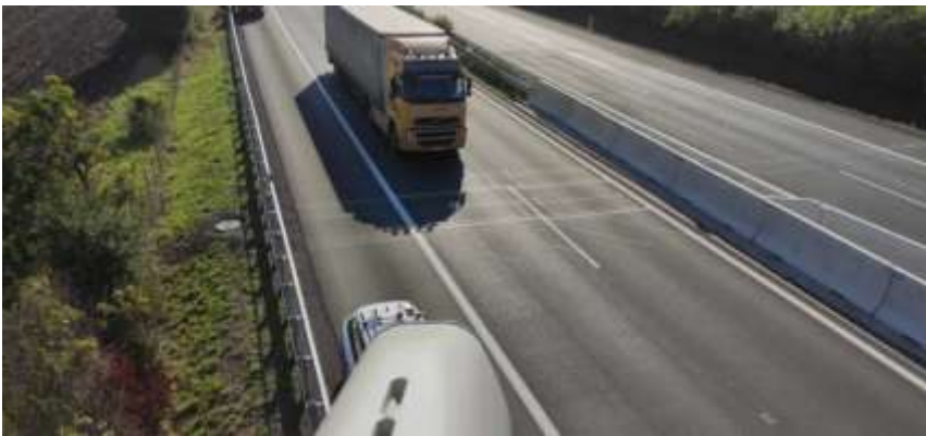
CrossWIM installed on a highway in Czech Republic

Weighing takes place on two series of weighing sensors, which complement the sensors for the detection of double axles, and also includes a camera system for front and rear reading of registration plates. Cross has installed WIM systems on the Czech highways D2, D5 and recently on the D8 motorway near the village Lovosice (47 th km). The system was tested with different types of vehicles passing at different speeds in cooperation with the Czech Metrology Institute. Based on the test the system was certified to perform automatic fines with an accuracy of 5% for GVW at a confidence level of >95%.