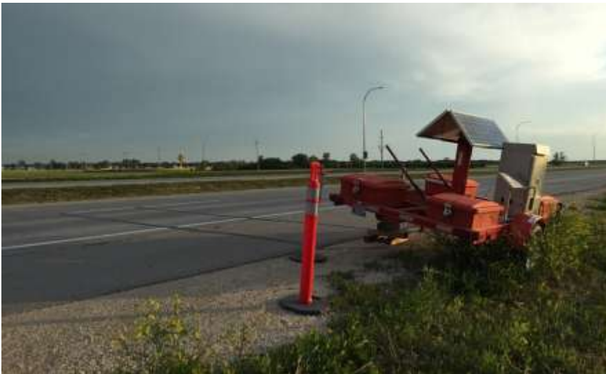
Portable WIM system Installed in Manitoba, Canada

The portable WIM system, which uses piezoelectric WIM sensors attached to the road with pocket tape and metal strapping, was installed three times in 2019 for one to three weeks each. All three installations were near existing load data sources (high-speed WIM, static weigh scale) to allow for a comparative analysis.