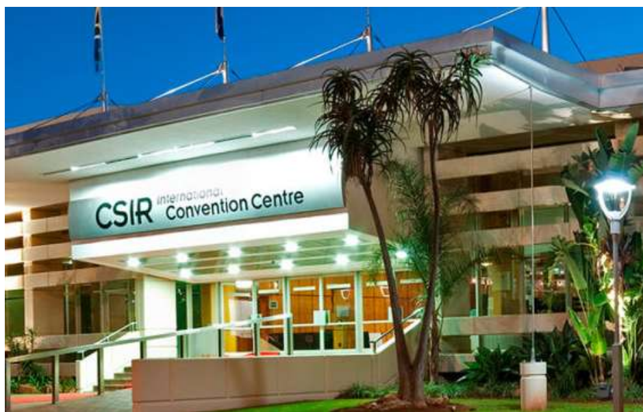
The CSIR Convention Centre in Pretoria, South Africa.

ISWIM has published the call for abstracts for the 3 rd Regional ISWIM Seminar 'Optimising Road Freight Transport using WIM Data'. The seminar will be held from the 7 th to the 9 th of November 2021 in the CSIR Convention Centre in Pretoria, South Africa. This is a key ISWIM event between two International Conferences (namely ICWIM8 and 9) with a specific focus on Sub-Saharan Africa.