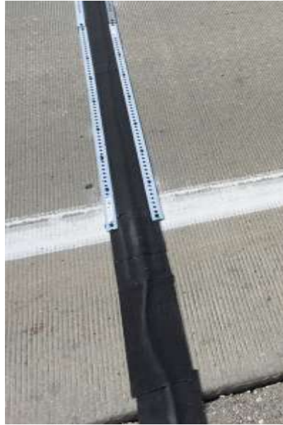
Portable WIM sensor installation

The results of this research will be published as a forthcoming master's thesis entitled " Feasibility of a Portable Weigh-in-Motion Technology for Axle Load Data Collection on Secondary Highways ", Department of Civil Engineering, University of Manitoba.