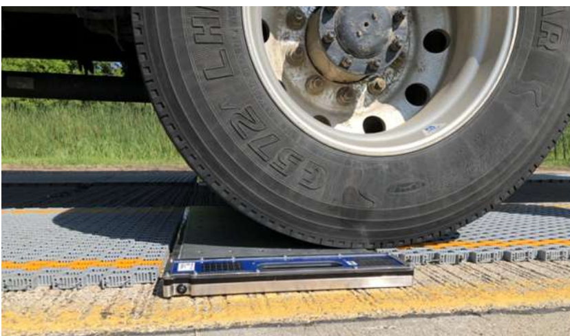
Portable LS788-WIM™ Scale by Intercomp

The US manufacturer of portable and in-ground scales and sensors has now released the low-profile LS788-WIM™ scale for Weigh-In-Motion (WIM) and static use. This product joins a portfolio of products for static and WIM use, including LS-WIM™ Axle scales, WIM strip sensors, and LS630-WIM™ and LP788™ portable scales which are all OIML certified.