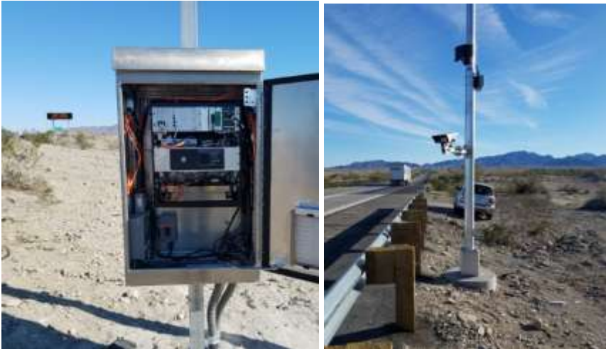
IRD's iSINC® Electronics and Roadside Screening Technology

International Road Dynamics (IRD) has carried out a significant upgrade of commercial vehicle operations for the Arizona Department of Transportation (ADOT). The new system screens for weight and vehicle identification at port-of-entry weigh stations. This E-screening allows ADOT to make better use of resources as compliant trucks bypass inspection. IRD supplied weigh-in-motion sensors, USDOT and license plate reader cameras, and message signs. In addition, IRD's TACS™ tyre safety screening systems are installed to identify commercial vehicles with unsafe tyre conditions.